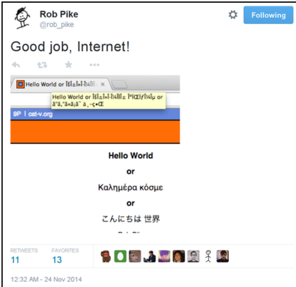
Figure 6: @rob_pike on Twitter