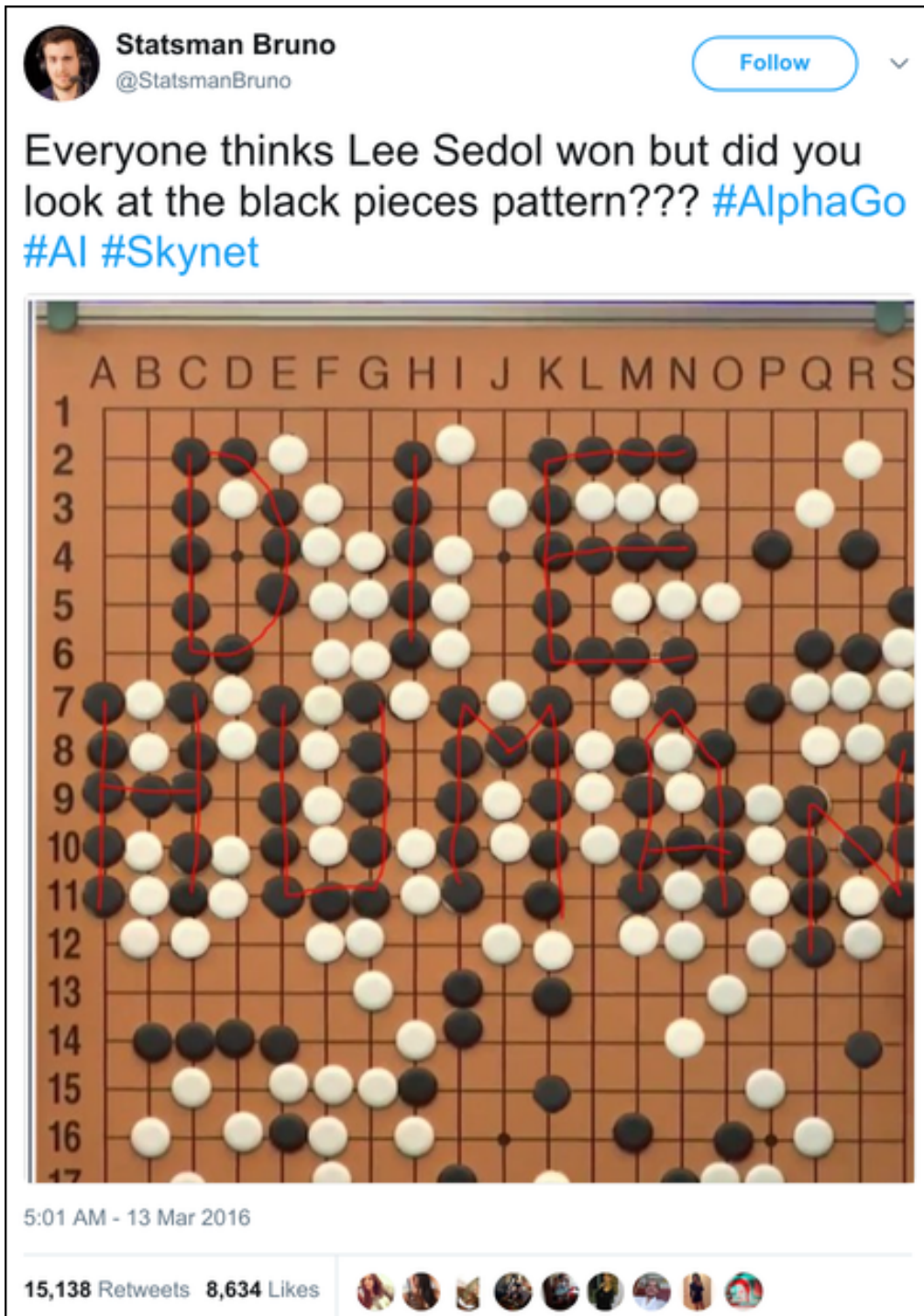
Figure 2: statsmanbruno on Twitter