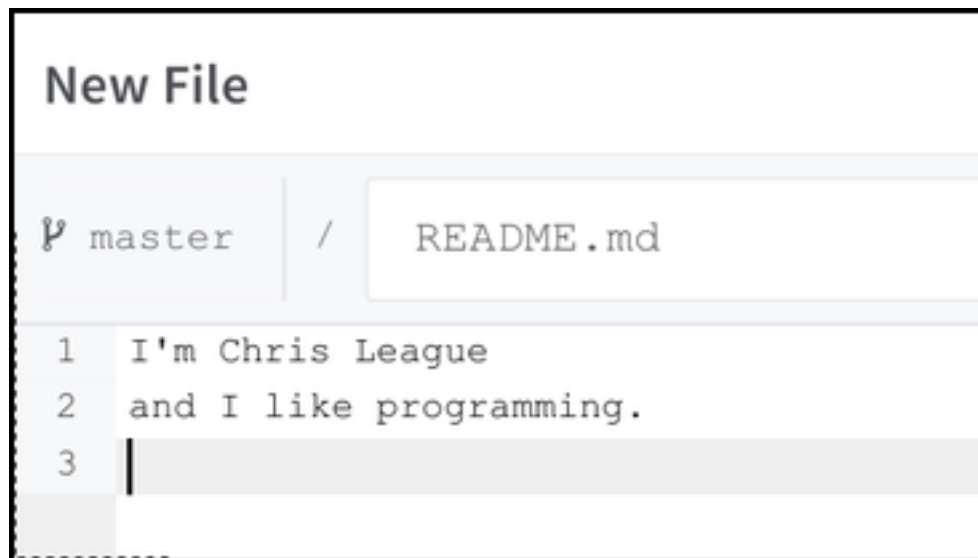
Figure 2: Add new README file